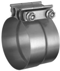
Torcite® Lap Joint