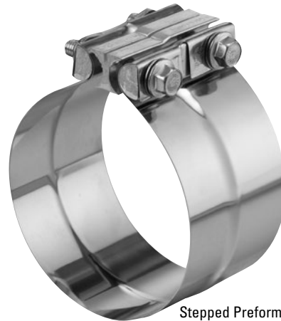
Stepped Preformed SealClamp

When installed, the wide band conforms to the shape of straight or flex pipe, and seals without distorting the pipe.